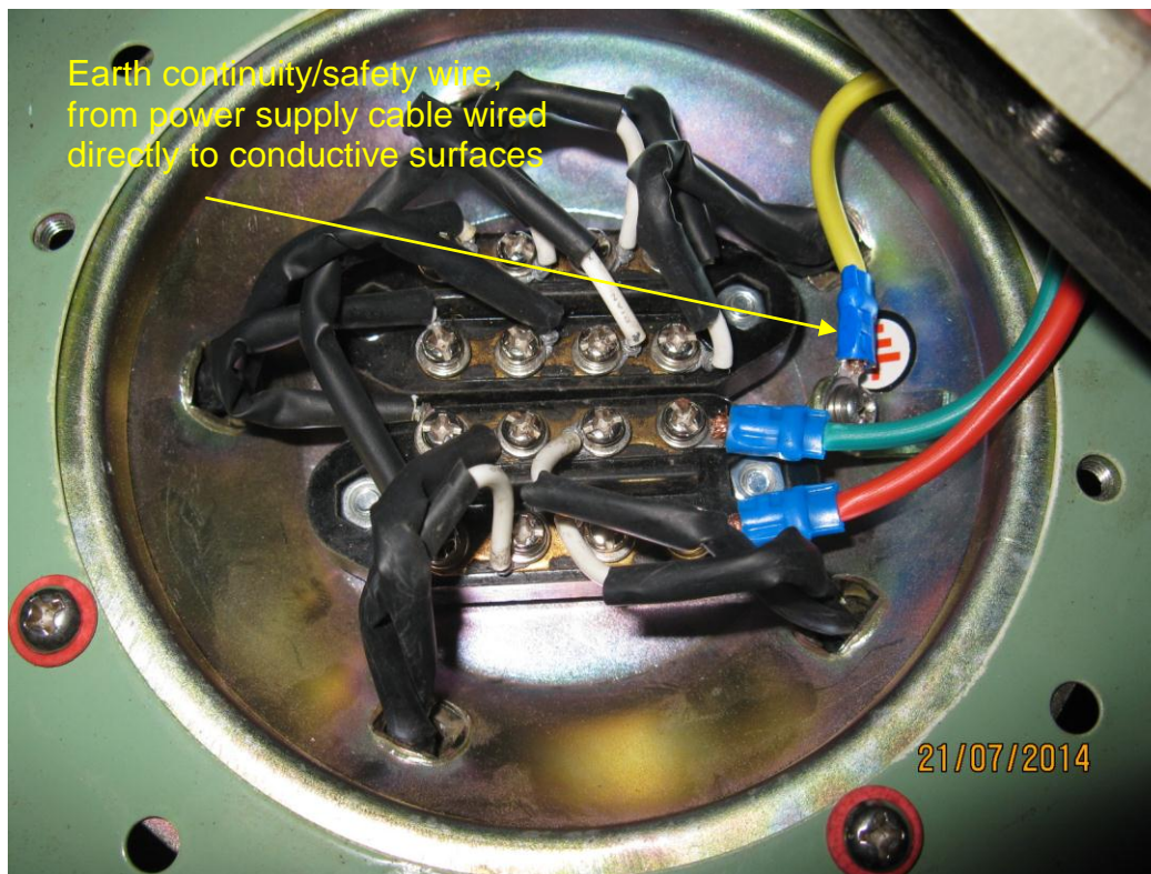
A correctly wired cluster light fitting having earth continuity/safety wire properly attached to a dedicated attachment point.

It is important to understand that the harm to a person is caused by the magnitude of current flow and length of time it acts rather than the actual voltage, although higher voltages do induce higher currents for the same resistance.