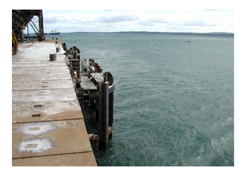
Basic Construction of the Kilroot Salt Jetty